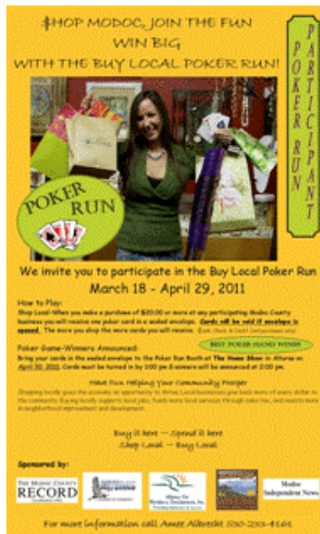
Buy Local Poker Run Flyer