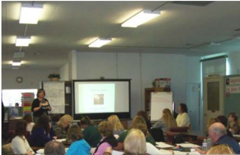
2011 Labor Law Update Workshop