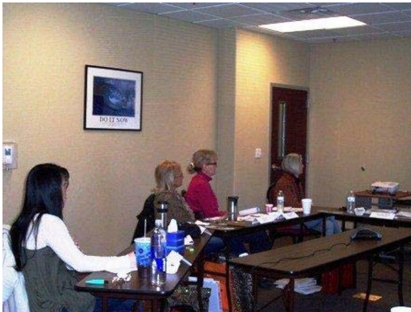
AFWD Staff Training