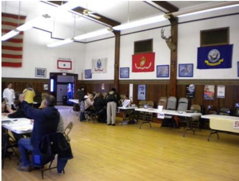
2011 Job Expo