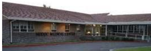
Modoc Medical Center

In early February we met with the Director of Staff Development from Modoc Medical Center to discuss a partnership in helping individuals to successfully complete CNA training. Modoc Medical Center had the training set up and was ready to recruit for the training. Modoc Employment Center staff assisted with this recruitment and also referred individuals from our applicant pool. Ten applicants were successful in being accepted into the training. We have been working with the individuals selected to make sure that they have all the necessary tools they need to successfully complete this program. We will continue to work together to provide assistance with this training program as well as future training programs.