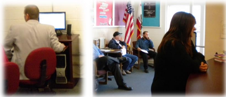
Dollar General Hiring Event

Modoc Business and Career Network vigorously worked with the Dollar General hiring team to fully staff the new Alturas store. Potential employees were supported throughout the hiring process with resume building, on-line applications, and pre-screen interviews. During the hiring event on January 24, 2014, the Dollar General team and all of the applicants were fully assisted by BCN staff. The Alturas store created over ten new job opportunities in Modoc County. We are delighted to congratulate the Managers, Assistant Managers, Lead Sales Associates, and Store Clerks on their new positions.