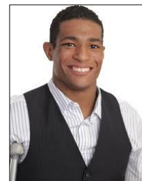
CWA Conference Pictures