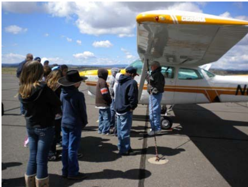
Students learning about Airplanes