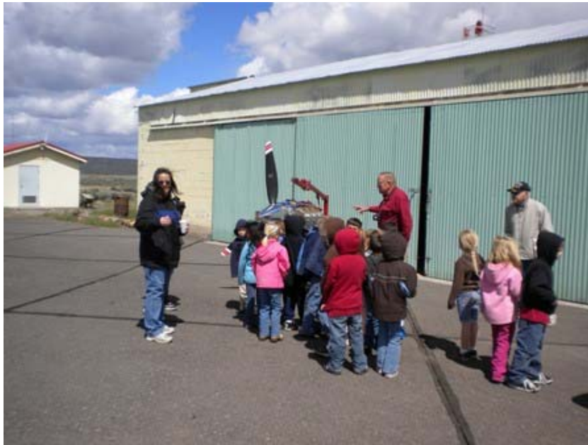
Students learning about airplane engines