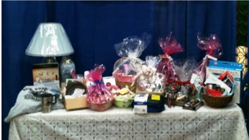
Some of the prizes for the Buy Local Poker Run