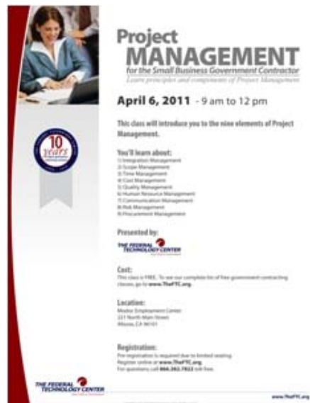
FTC Project Management Workshop