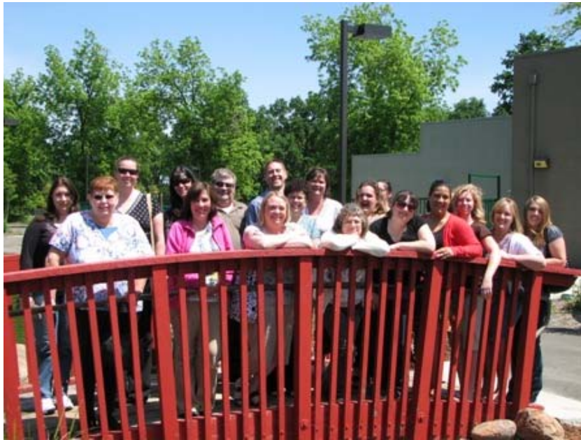
AFWD Staff at NoRTEC Retreat