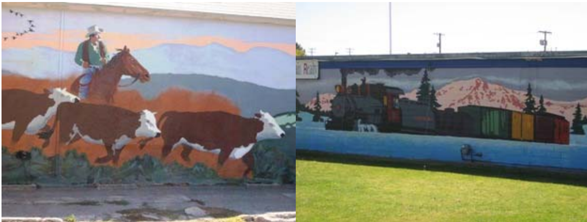
Two of the finished Murals.

The overall goal of these projects is to make Main Street in Alturas more attractive and inviting to visitors, thereby improving the economic vitality of the area and increase the potential customer base. This will help existing businesses survive and encourage new businesses to locate in the community.