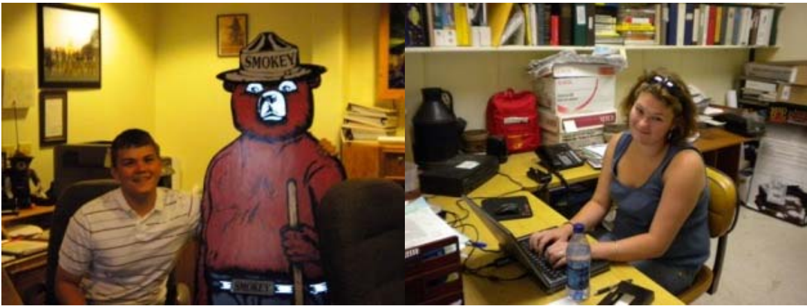
US Forest Service and University of CA Extensions Summer Jobs Program Participants