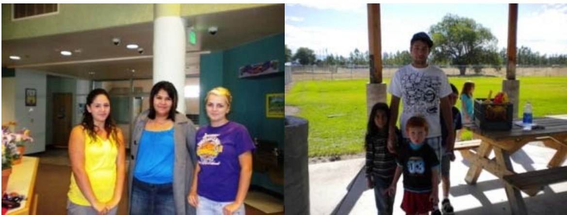
Tulelake Newell Family Resource Center & Modoc Child Care Council Summer Jobs Program Participants