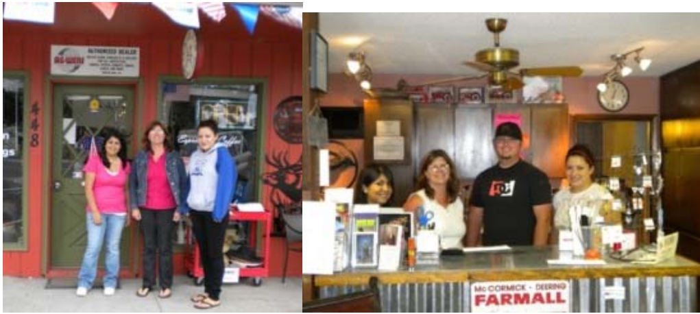
Tulelake Farm Supply Summer Jobs Program Participants