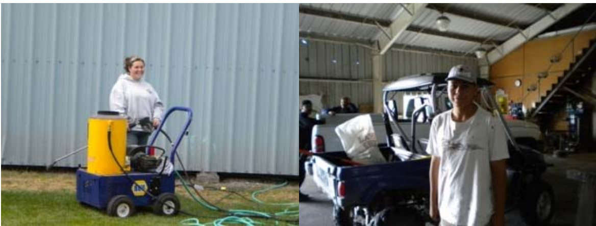
Tulelake Fairgrounds Summer Jobs Program Participants