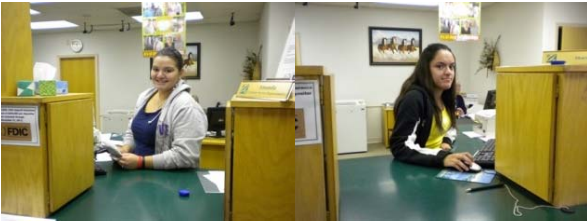
Plumas Bank Summer Jobs Program Participants