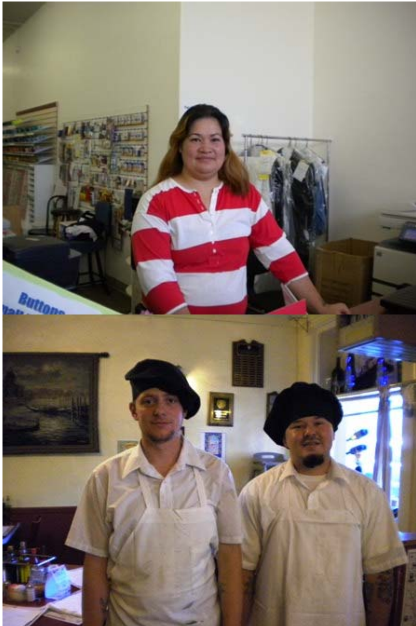
Participants in the 2010 Jobs Program