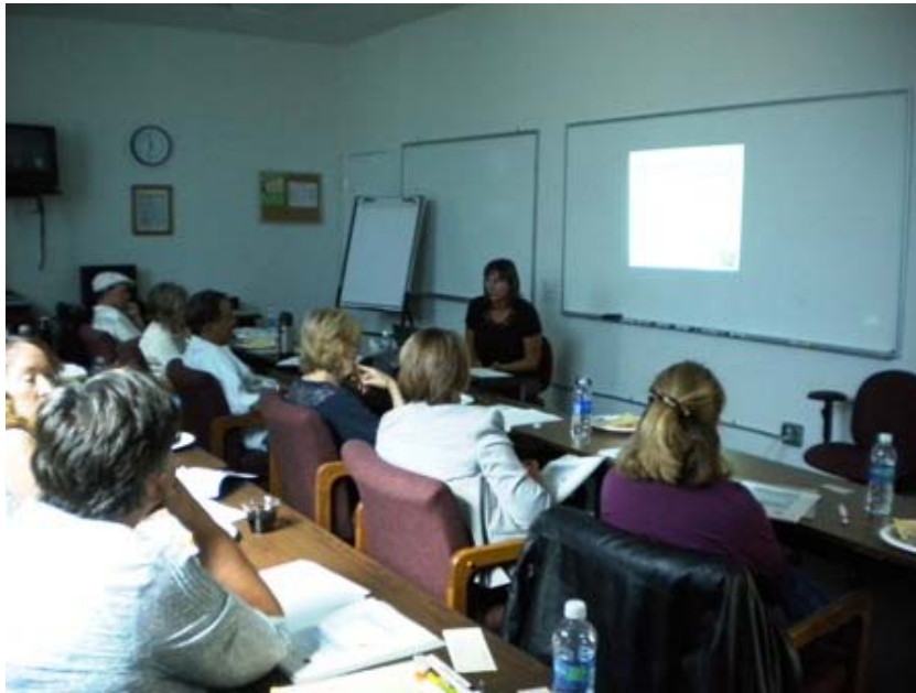
Healthcare Reform Workshop