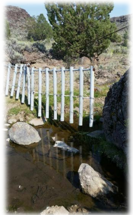
PVC piping that protects creek portion of enclosure from entry (Continued on next page)