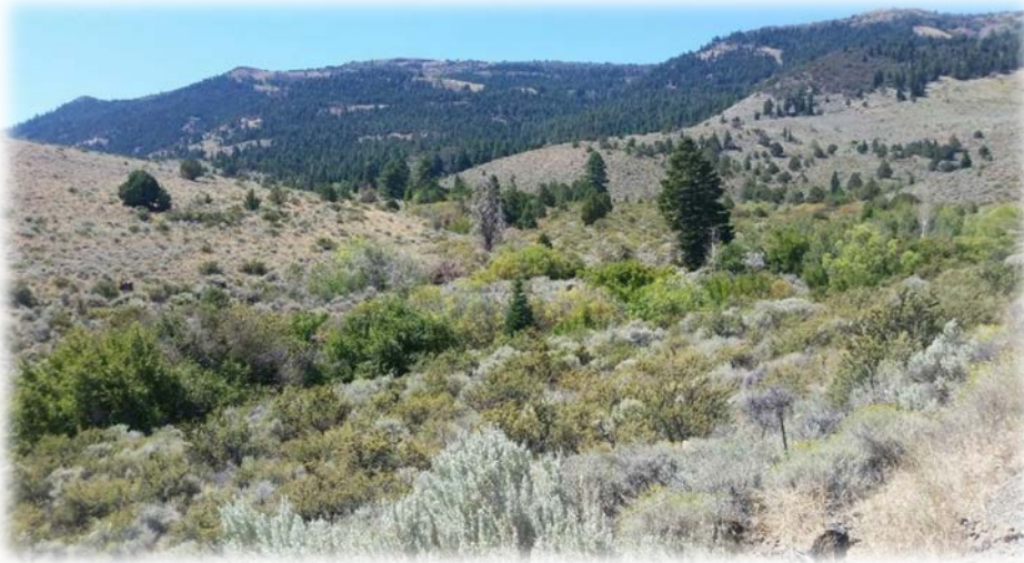
Protected riparian area inside exclosure fencing

One of Garth's duties has been to repair fencing which protects riparian areas from animal entry and disturbance. This protective fencing is called an "exclosure." Exclosures protect the wetlands and banks adjacent to rivers, creeks and streams which are called "riparian areas." Protecting these areas is especially important during drought. Animal disturbance can cause soil erosion which can lead to a buildup of sediment in the waterway reducing water flow. Riparian areas also act as a natural filter for water as it travels, which contributes to healthy water quality.