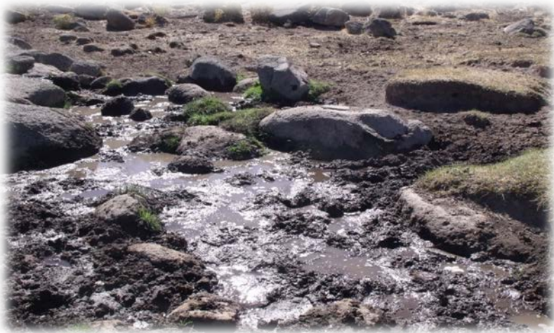
Disturbed spring area