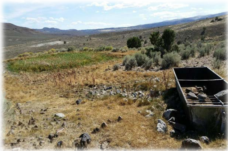
Developed Spring System and Trough Needing Repair