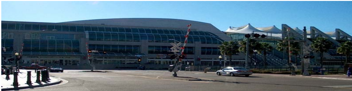
San Diego Convention Center

The Society for Human Resource Management (SHRM) staged their annual conference at the San Diego Convention Center for members to network, hear updates from Human Resource (HR) professionals, collect CE units and recertify credentials. From June 27 through June 30, Alliance for Workforce Development, Inc. staff attended the 2010 SHRM Conference in San Diego, CA along with 11,600 other members. We attended sessions and soaked up information and strategies for leading, inspiring and motivating your workforce, strategic human resource management, the complexities of healthcare reform and many more topics.