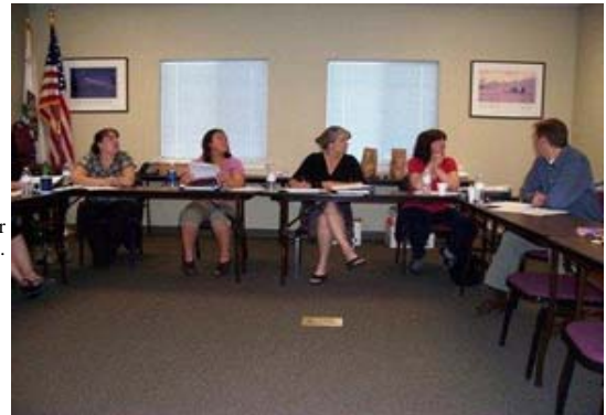
Career Center Advisors meet for training.