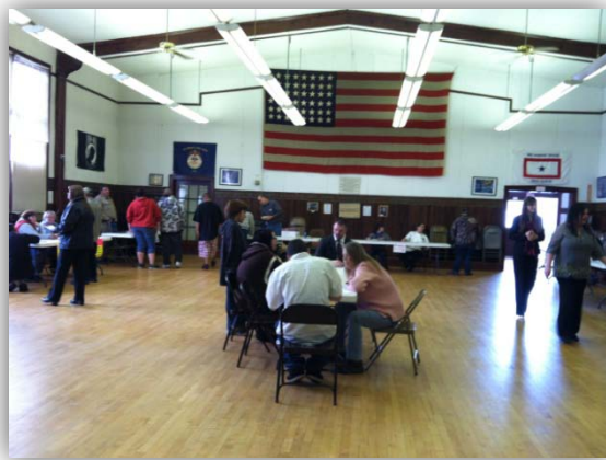
Job seekers filling out applications