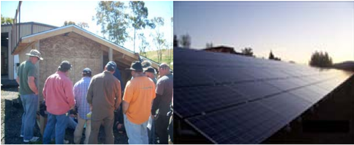
(left) Clean Energy students watching a solar hot water heater installation demonstration and (right) Butte College' Solar Panels.

Butte College has developed a curriculum presenting information in the areas of Intro to Residential Construction, Environmental Training, Intro to