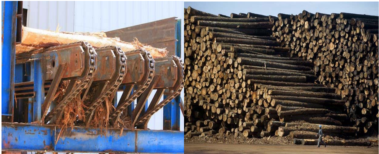
(left) Chain Conveyor (right) Log Deck.

AFWD's Career Center Advisors have been working closely with our EDD representative to develop training plans and budgets for various training programs. The first group of trainings will begin in June and July including three clients who will attend Heavy Equipment Operator training at the Northern California College of Construction's training site in Stockton, California. We also have five clients who will be attending Northwest Lineman College's sixteen week Electrical Lineworker program in Oroville. We have one client scheduled to attend National Communications Training Center's three week Fiber-optic Broadband Technician training. And, we have one client who will attend Rockwell Automation's Programmable Logic Controller (PLC) training in San Ramon, California.