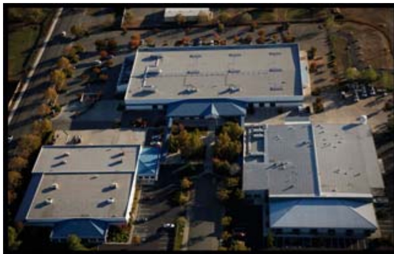
An arial view of the CleanTech Innovaton Center (CIC)

Two clients of Plumas Work Connection recently completed one week Weatherization training at Cleantech Innovation Center in Oroville, California. CIC/Oroville is the first flagship project of the BayTEC Alliance. For more information on CIC and BayTEC, please view their website at, http://www.cicoroville.org/ CIC is a relatively new training provider with a focus on energy efficiency and green construction methods. In the spirit of reuse and renewal, their 42,000 square foot facility is remodeled from a once empty manufacturing facility.